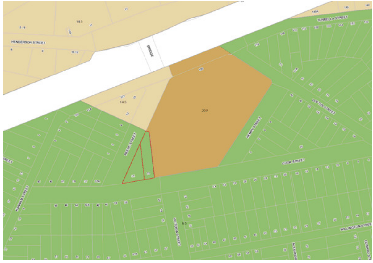
Figure 4 – RLEP 2011 Height of Building (Subject Site - 8.5 metres)