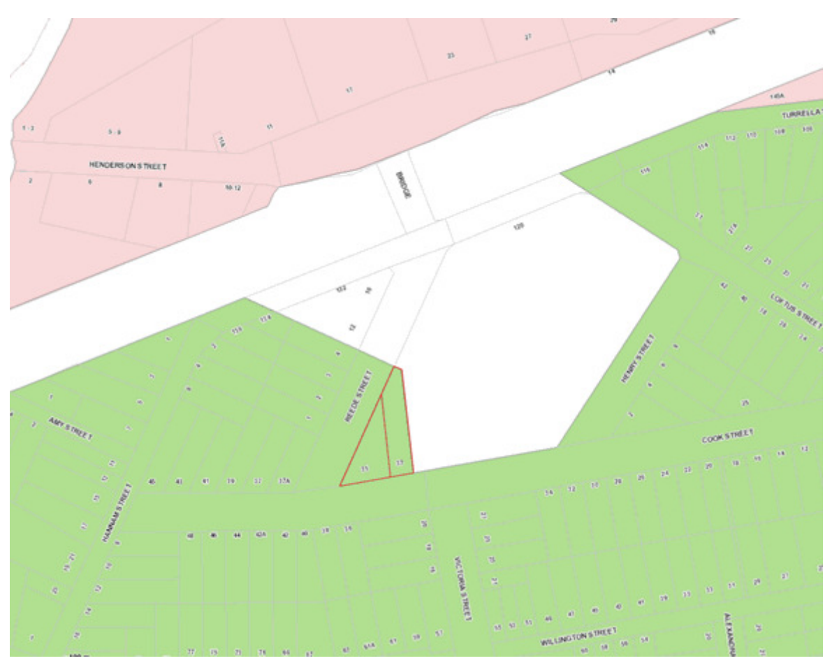
Figure 3 – RLEP 2011 Minimum Lot Size (Subject Site - Minimum Lot Size 450 m2)