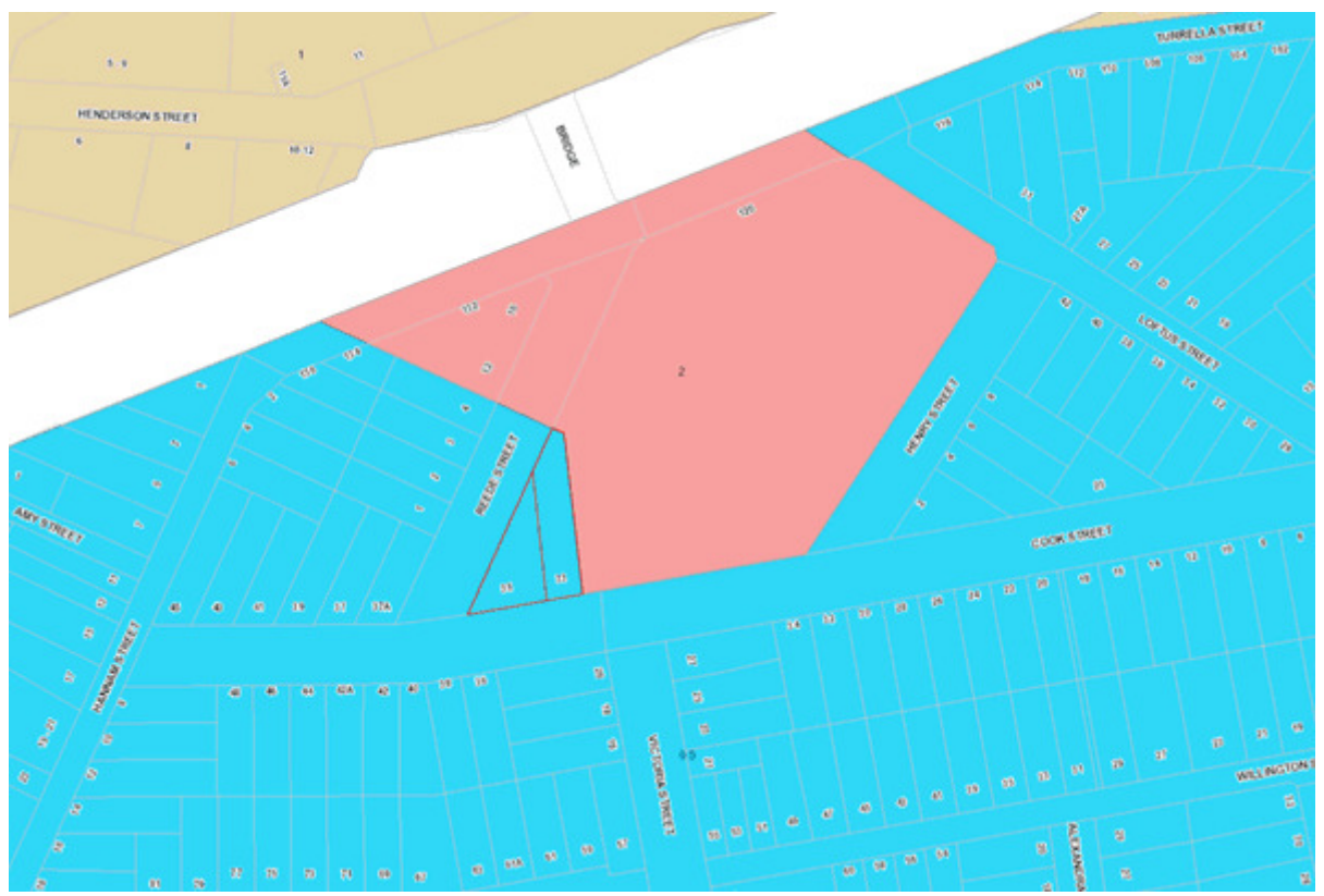
Figure 5 - RLEP 2011 Floor Space Ratio (Subject Site - 0.5:1)