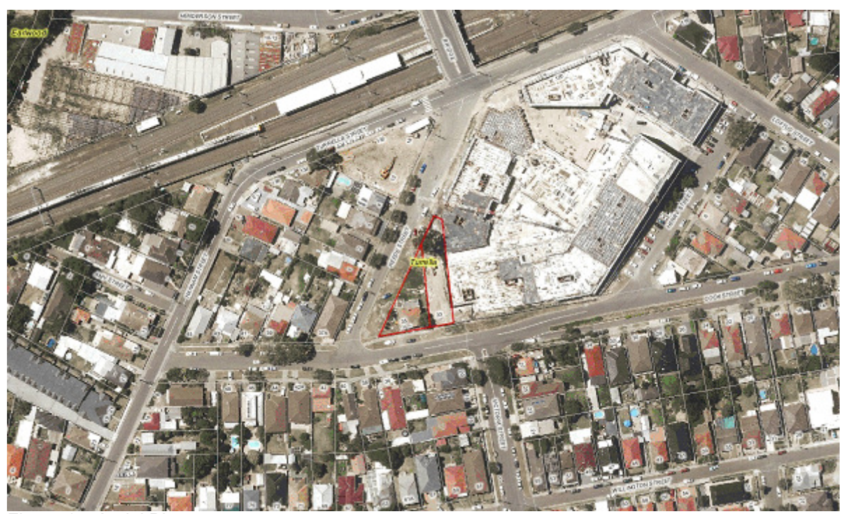
Figure 1 – Aerial Photo